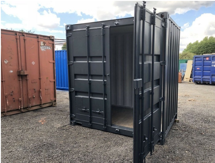
EXAMPLE OF A COMMUNITY FRIDGE & CUPBOARD